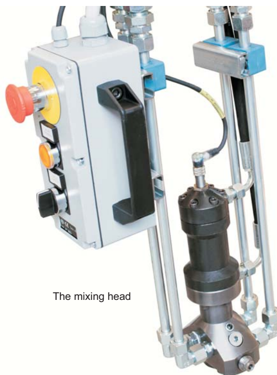
The mixing head